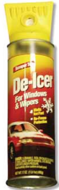
"Hangar-in-a-can" products are small enough to fit in a flight bag.

Cleaning off the windshield is slightly different. Some pilots clear the aircraft's windshield by using a clean towel or shop rag. Other pilots start the airplane and wait for the defroster to do the job. This could take a while in cold weather at idle power. Both of these techniques work without damaging the windshield. Do not use car ice scrapers, credit cards, or any other hard plastic device to remove frost or snow from the windshield. Do not taxi until you can see enough to move safely. No cheating!