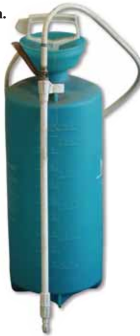
A garden sprayer can be used to help remove frost.

Glycol is the most expensive and generally only available at select FBOs. Polypropylene antifreeze is pink in color and is available at RV, automotive or marine stores. Placed in a small garden sprayer, it works quite well (especially if the sprayer is heated to room temperature). A note of caution, though: Composite aircraft owners should test it in an inconspicuous area first, as there have been reports of staining.