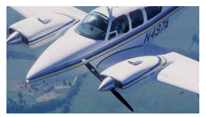
Feather the "dead" propeller in a twin after verifying that the engine has indeed failed. At low altitudes or airspeeds, it may be necessary to feather immediately.

Propellers are another issue. A windmilling propeller adds drag, decreasing the glide performance of the aircraft. In most multiengine aircraft, pilots can solve this problem by feathering the "dead" propeller. Pilots of single engine aircraft don't have that option, but if the airplane has a constant speed propeller (and enough oil pressure), putting the propeller control in the low-rpm (aft) position will increase the blade angle and in many cases give a noticeable improvement in glide performance.