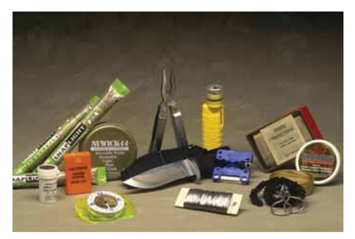
An ideal survival kit is comprised of high quality components, and is customized for the terrain, season, and climate.

One item many pilots count on to help searchers locate them after a crash is an ELT (Emergency Locator Transmitter). Unfortunately, the 121.5 mhz ELTs installed in most general aviation aircraft perform poorly. The vast majority of signals are false alarms, and the nature of the system means that it can be several hours before a real signal is even received. Even then, the search area may be quite large.