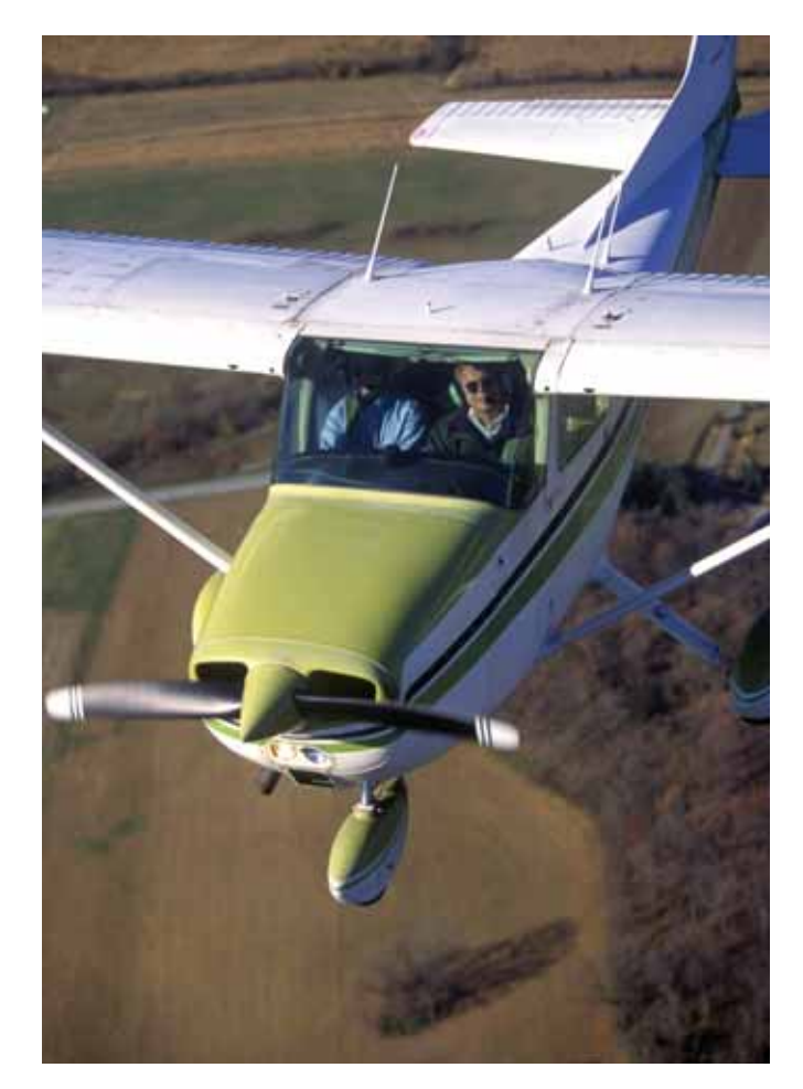
If the prop stops (and there's fuel in the tanks), expect side effects—oil, smoke, and fire are possibilities.

On the bright side, most engine failures don't just "happen." There's a good chance that the engine has been giving hints about its poor health in the hours leading up to the failure. Abrupt changes in oil consumption, unusual engine monitor indications, failure to develop proper static rpm, or unusual noises or vibrations are all worth investigating. Have a mechanic take a look: It might be inconvenient and expensive, but a forced landing will be worse!