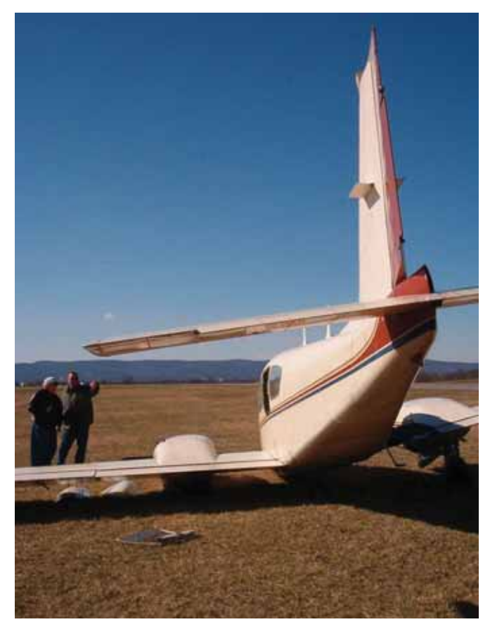
Gear-up landings usually cause only minor damage. The aircraft in this photo was repaired and flying again in a matter of weeks.

Troubleshoot a landing gear issue within reason, but don't put the aircraft at risk doing so. Despite the intense scrutiny they often receive in the media, most gear-up landings are uneventful, highly survivable, and relatively damagefree. It's worth remembering that fact when tempted to try a "stunt" to get the gear down.