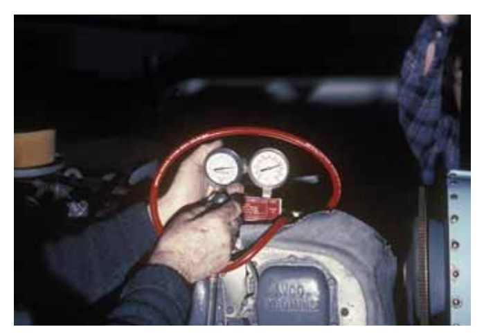
Impending mechanical failures often reveal themselves over time, and can be prevented through good maintenance.