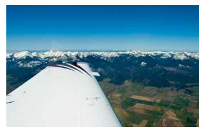
If the engine failed here, the pilot would have plenty of potential landing spots. Twenty or thirty miles left of course, the situation would be entirely different.

takeoff, or oxygen system failures at 25,000 feet, come to mind. These are the kinds of issues for which pilots should be "spring-loaded." Significant time should be devoted to training for them, and immediate responses should be practiced regularly and (in the case of engine failure on takeoff) briefed prior to departure. Take this step seriously: Mindless recitation doesn't cut it.