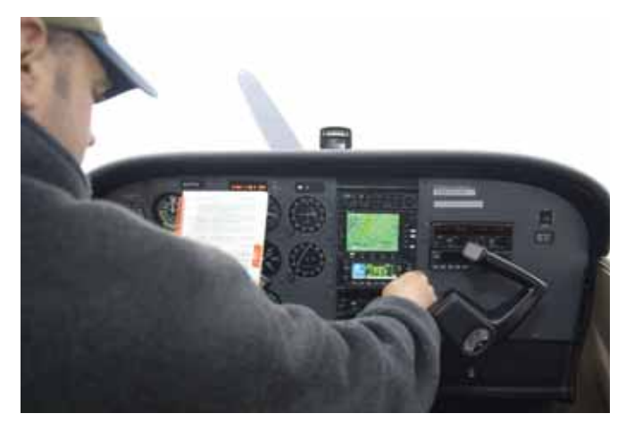
Know when—and when not—to break out the emergency checklist. Initial responses to critical, time-sensitive problems should be memorized.

On the bright side, most engine failures don't just "happen." There's a good chance that the engine has been giving hints about its poor health in the hours leading up to the failure. Abrupt changes in oil consumption, unusual engine monitor indications, failure to develop proper static rpm, or unusual noises or vibrations are all worth investigating. Have a mechanic take a look: It might be inconvenient and expensive, but a forced landing will be worse!