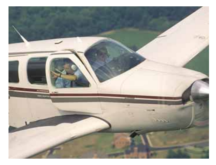
Situations like this can be startling, but they don't call for extreme measures. Why make things difficult? Land the airplane and solve the problem on the ground.

If asked to name the first emergency situation that comes to mind, most general aviation pilots would probably answer "engine failure." That makes sense: Engine failures are the focus of much training and practice. But a real-life engine failure usually isn't the sterile exercise most pilots have come to expect when the CFI reaches over and yanks the throttle. The tach probably won't just drop to 1000 rpm and remain there. The engine will likely be shaking violently, even—and there may be oil on the windshield. Smoke and fire are possibilities. In some cases, the engine may seize. In short, there's a "reality factor" that can make it more difficult to take the appropriate action.