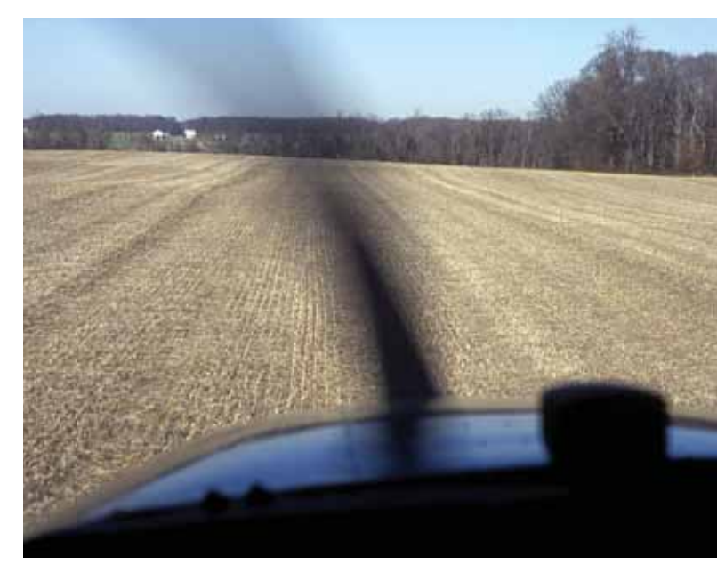
The moment of truth. Low airspeed is preferable in off-airport landings, but don't stall the airplane trying to achieve the slowest possible touchdown.

Having chosen a landing spot, it's time to make sure that the aircraft and its occupants are prepared for the landing.