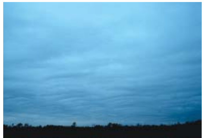
Stratus clouds - a sign of stable air