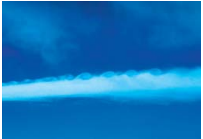
“Billows” cloud - a sign of turbulent air